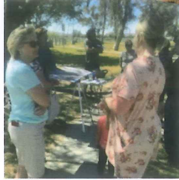
Aquatic Center River Walk